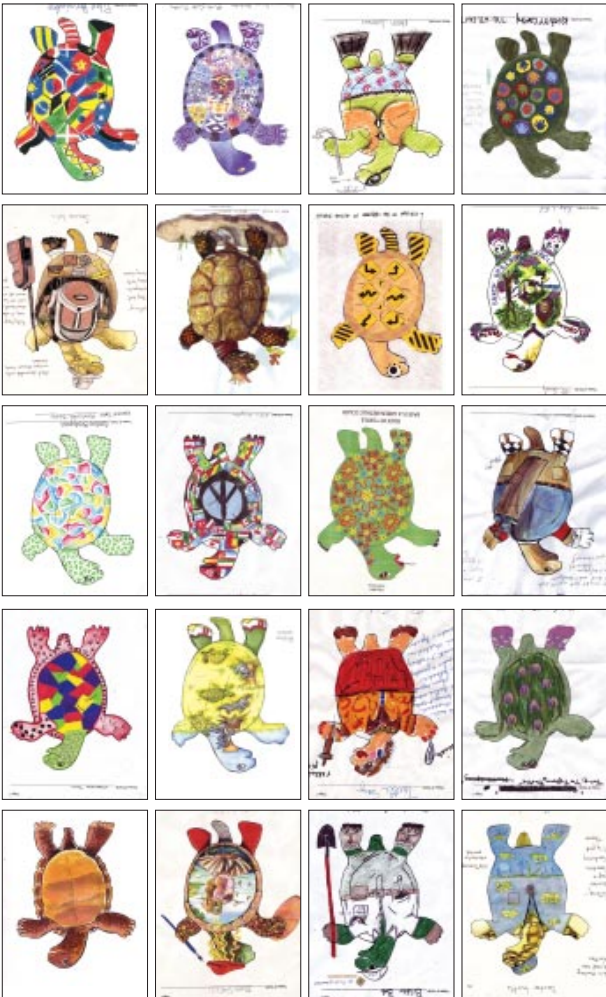
SOME ORIGINAL SKETCHES OF TURTLES YOU'LL SEE